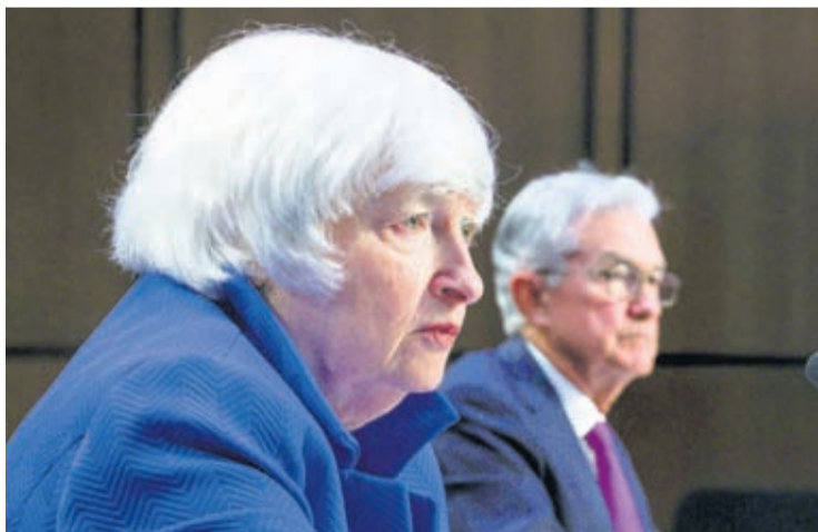
Treasury Secretary Janet Yellen, left, and Federal Reserve Chairman Jerome Powell, appear before a Senate Banking, Housing and Urban Affairs Committee hearing on the CARES Act on Capitol Hill, Tuesday, Sept. 28, 2021 in Washington.